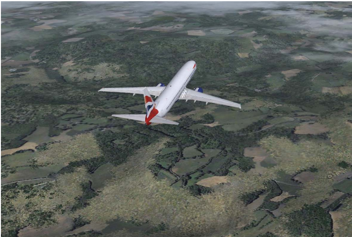
Approaching EGCC on FS9 with mesh and land class from fsproject and terrain from Ground Environment. Aircraft is a PMDG 737-800 in BA colours

With mesh and land class installed, the simulator uses the default terrain bitmaps to cover the surface according to the shape of the mesh and the type of landclass installed. If you want the ground to look even more realistic, you need terrain textures. Again, these come in a confusing combination of free files, commercial packages, colours and shapes. FSScene is one of the oldest out there: they offer textures for different continents and seasons, which comes quite expensive if you want to cover the world. At the time of writing, the newest, best and cheapest solution is a package called "Ground Environment 2006" (also available in Pro version) offered by Flight1. It covers the entire world with fairly appealing textures and thus eliminates the need for regional solutions. It also includes all four seasons, since uses different files to portray winter, spring, summer, and fall landscapes.